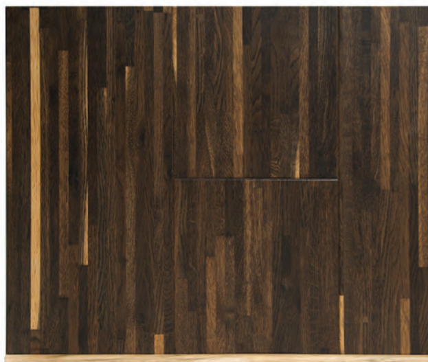
Edgeline - Available in 7"

The beauty of White Oak, the stability of Vintage Solid Sawn combined with a process called “Fuming” that produces the “color” to penetrate through out the top lamella. Creating a very beautiful, stable and unique floor, which looks a lot like Black Walnut. This fuming process also makes the White Oak more stable. Compared to a dark brown stain on top of a white wood, scratches and dents will blend in more with the fumed oak, since the colour goes through and is therefore a great choice for both residential and commercial applications.