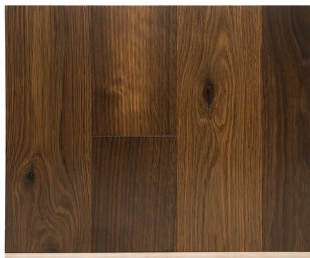
Old Oak - Available in 5" & 7"